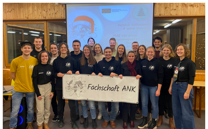
Die Fachschaft ANK