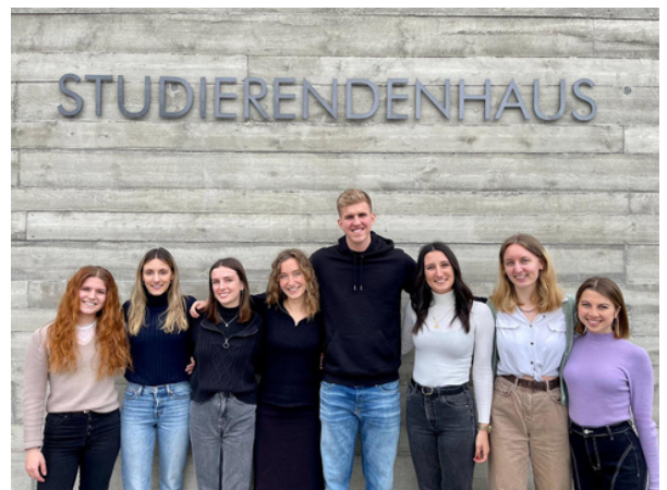
The Board of Directors of IRM network e.V.